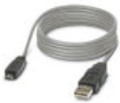
Connecting cable, for connecting the controller to a PC for PC Worx and LOGIC+, USB A to micro USB B, 2 m in length.

Connecting cable - CAB-USB A/MICRO USB B/2,0M - 2701626