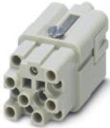
HEAVYCON socket insert, Q12 series, 12-pos., crimp connection, with coding option

Please be informed that the data shown in this PDF Document is generated from our Online Catalog. Please find the complete data in the user's documentation. Our General Terms of Use for Downloads are valid ( http://phoenixcontact.com/download )