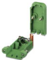
Cable housing, pitch: 0 mm, number of positions: 5, dimension a: 39.9 mm, color: green

Please be informed that the data shown in this PDF Document is generated from our Online Catalog. Please find the complete data in the user's documentation. Our General Terms of Use for Downloads are valid ( http://phoenixcontact.com/download )